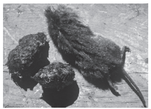
Figure 2. Barn Owl ( Tyto Alba ) pellets and decapitated meadow vole ( Microtus pennsylvanicus ) collected in the Creston Valley, BC. 7 September 1994 (Linda M. Van Damme).

analysis, has been studied extensively on southeastern Vancouver Island and the lower Fraser River valley in extreme southwestern British Columbia. Here rodents and insectivores made up 98% of the Barn Owl's diet with the Townsend's vole ( Microtus townsendi ) constituting nearly