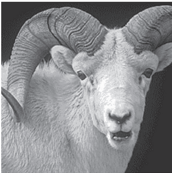
Figure 1. Adult male Dall's thinhorn sheep. Sheep Mountain, Yukon Territory. May 1977. (Fred L. Bunnell).

Populations with colour intergrades between Dall's and Stone's sheep occur in both northwestern BC and the Yukon and Northwest Territories. These are not considered separate subspecies. Compared to bighorn sheep, the horns of thinhorn sheep are more triangular in cross-section, flare more widely from the head, and are rarely "broomed" or broken at the tips. Despite their variable colour, Stone's sheep never show the dull, medium-brown coat colour of bighorn sheep.