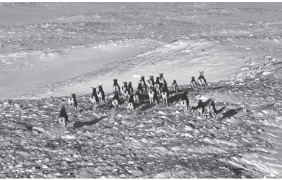
Figure 5. In winter, Stone's thorn sheep congregate in mixed sex and age classes in drier and more windswept mountainous habitats. Mount Mary Henry, BC. 26 February 1995. (R. Wayne Campbell).

support graminoid forage (grasses, sedges, and rushes), a variety of forbs, and low shrubs (e.g., Dryas , Salix , Vaccinium , and Empetrum ). These areas are usually under deep snow during winter. During summer, nursery groups (ewes, lambs, and yearlings) may not venture as far from lambing areas as do rams. After the rut, about mid-November to mid-December, all sex and age classes congregate on the more localized winter range, which may be the lambing area. Winter ranges are lower in elevation, drier, and typically windswept (Figure 5). Less precipitation and higher winds on these ranges keep snow from accumulating and permit access to forage beneath the snow. Both subspecies enter forest edges during winter, but find most of the forage in adjacent open areas.