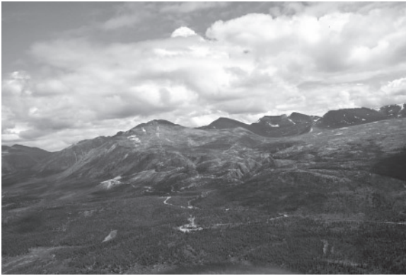
Figure 4. The Summer range of Stone's thorn sheep includes a variety of nutrient-rich forbs and grasses in remote subalpine regions frequently near escape terrain. Near Atlin, BC. August 1980.

support graminoid forage (grasses, sedges, and rushes), a variety of forbs, and low shrubs (e.g., Dryas , Salix , Vaccinium , and Empetrum ). These areas are usually under deep snow during winter. During summer, nursery groups (ewes, lambs, and yearlings) may not venture as far from lambing areas as do rams. After the rut, about mid-November to mid-December, all sex and age classes congregate on the more localized winter range, which may be the lambing area. Winter ranges are lower in elevation, drier, and typically windswept (Figure 5). Less precipitation and higher winds on these ranges keep snow from accumulating and permit access to forage beneath the snow. Both subspecies enter forest edges during winter, but find most of the forage in adjacent open areas.