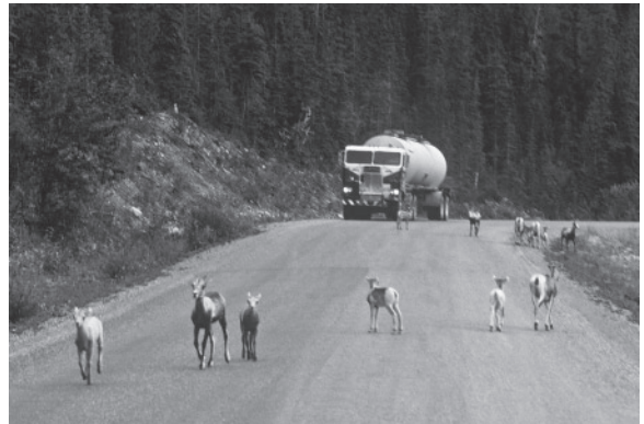
Figure 8. Vehicle traffic along the Alaska Highway in northeastern British Columbia is a source of mortality for Stone's thinhorn sheep, especially lambs. Muncho Lake, BC. August 1980. (R. Wayne Campbell).

Stone's sheep are killed by vehicle traffic on the Alaska Highway, particularly in the area around Toad River and Muncho Lake, which they regularly frequent (Figure 8). There is no record of the number of kills. In fact, the British Columbia Ministry of Transportation Wildlife Accident Reporting System shows no road kill for any sheep in northern British Columbia over the period 1983 to 2002, indicating the reporting system is incomplete. Both wolf predation and human harvest have caused declines when populations already were stressed by severe winter weather. None of these factors appear to be a persistent threat to thinhorn numbers.