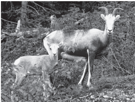
Figure 2. Adult female Stone's thinhorn sheep with lamb near Muncho Lake, BC. August 1980. (R. Wayne Campbell).

Thinhorn sheep are endemic to North America, where they occur in the mountains of Alaska and northwestern Canada. Dall's sheep are found in Alaska, including the