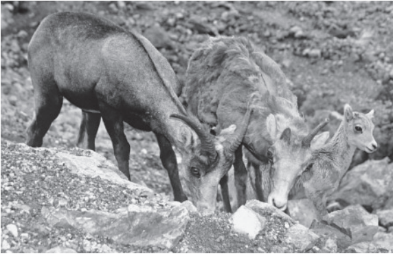
Figure 7. Stone's thorn sheep travel long distances to utilize mineral licks, but their purpose is not fully understood. Summit Lake, BC. 2 July 2005. (R. Wayne Campbell).

to be limiting. Mountain sheep invariably seek areas with some form of escape terrain nearby. There appears to be no difference in Dall's sheep demography in areas of high and low wolf density. Stone's sheep stray farther from escape terrain and enter timbered areas more commonly, so they probably are more susceptible to predation.