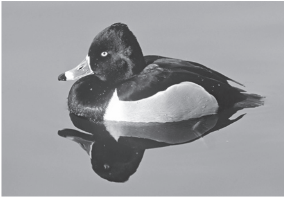
Figure 2. Adult male Ring-necked Duck, Vancouver, BC. 9 February 1993. (R. Wayne Campbell). Although hundreds of “ring-necks” are now over-wintering on fresh-water lakes on Salt Spring Island, they are rarely seen from May through October.

to whether habitat conditions improved after the 1980s in St. Mary Lake. No direct studies were made, but limnological surveys show that the lake is undergoing eutrophication. Biomass of molluscs or other food sources could be increasing, but this is conjecture. Also, Lesser Scaup ( Aythya affinis ), which winter on Salt Spring Island, and occur most years on St. Mary Lake, did not become more numerous in the past decade or so. If habitat changes did occur, they seem to have benefited only Ring-necked Ducks.