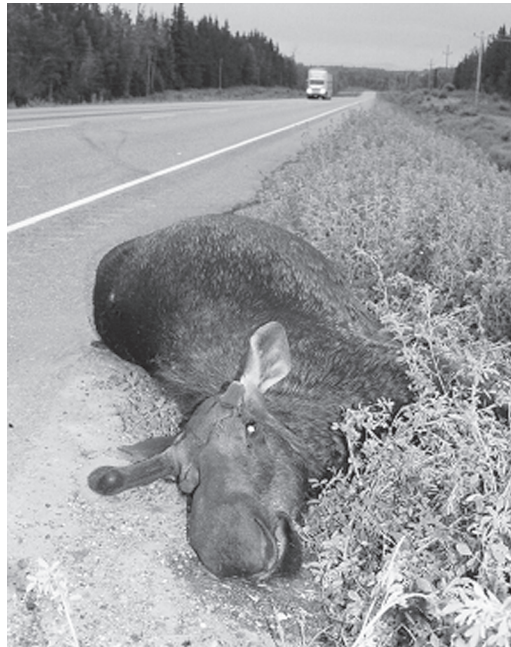
Figure 1. Collisions with Moose continue to be a serious threat to the motoring public in many parts of northern BC. Highway 16 east of Vanderhoof, BC. June 2003.

we have modified a road safety device that utilizes Global Positioning System (GPS) technology to capture date, time, and location using specifically designed waypoint buttons for deer ( Odocoileus spp.) and Moose ( Alces alces ), which are the most commonly observed large animals on roads in northern BC. Ten units are currently deployed in trucks that ferry goods back and forth along designated routes in northern BC several times a day. When a truck driver observes a Moose or deer in the road corridor, he or she depresses the appropriate button to record a waypoint of that animal. If the deer or Moose observed is dead, the trucker depresses a "dead" button on the unit quickly after selecting the Moose or deer button. Location, date, and time of day as well as species and whether or not the animal is dead are recorded in the unit's memory. Twice per month, data are downloaded by company dispatchers and e-mailed to our research team at the University of Northern BC where it is uploaded into GIS mapping