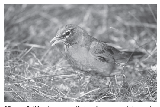
Figure 1. The American Robin forages widely on the ground for invertebrates but may opportunistically feed on some small vertebrates it encounters. June 1985 (Douglas Leighton).