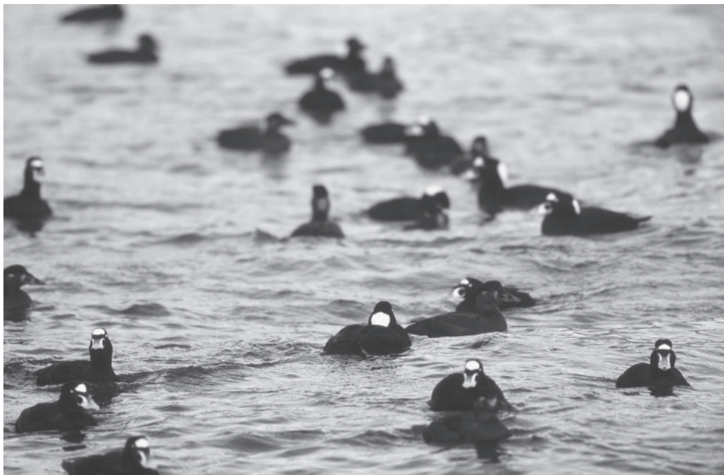
Figure 1. Each year Surf Scoters stage in immense flocks during the non-breeding season at favourite locations along the British Columbia coast. Vancouver (Stanley Park), BC. 16 January 1995 (Michael I. Preston).

It is estimated that migrant and winter populations of Surf Scoter in British Columbia may contain 30 to 50 percent of the North American population (Campbell et al. 1990), which would represent up to 500,000 individuals (Sea Duck Joint Venture 2004). Birds tend to congregate around suitable foraging areas, such as Pacific herring ( Clupea pallasii ) spawn sites. Surf Scoters are blue-listed in British Columbia. Although they are a managed game bird, their population has been declining over the past 50 years (Boyd et al. 2001). Since this species spends the majority of its annual cycle in non-breeding