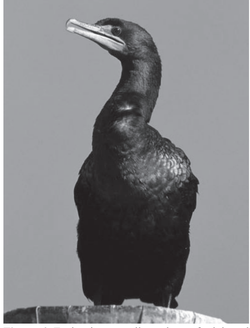
Figure 6 . Each winter small numbers of adult and immature Double-crested Cormorants feed and roost in Theodosia Inlet, BC. Sidney, BC. 8 November 1997.