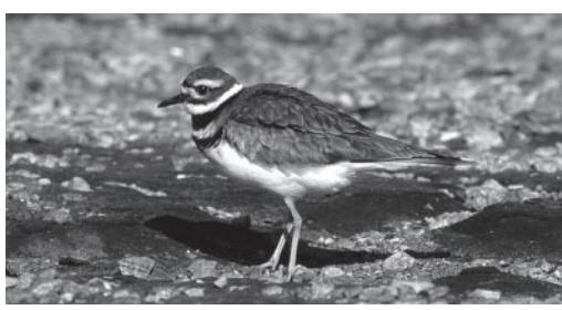
Figure 7. The Killdeer is one of the few species that is present in the Theodosia Inlet study area throughout the year. Esquimalt Lagoon, BC. 14 November 1997 (R. Wayne Campbell).