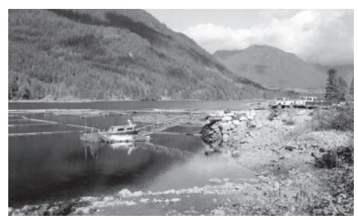
Figure 3 . The study area includes two small log storage and handling sites on the south side of Theodosia Inlet about 1 km from the mouth of Theodosia River, BC. 28 September 2007 (Ivar Nygaard-Petersen).

The climate is mild year round with abundant precipitation during the winter months followed by relatively dry summers. Watersheds surrounding the inlet have been logged and presently vegetation in the upland areas consists of a mixture of second-growth stands of Douglas-fir, western hemlock, and western redcedar. The main deciduous trees are red alder and bigleaf maple.