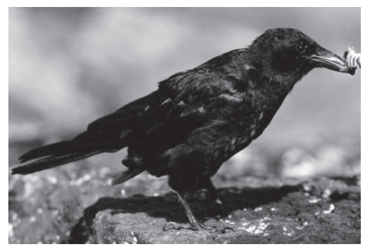
Figure 11. The Northwestern Crow, a year-round resident in Theodosia Inlet, feeds on a wide variety of foods including intertidal crabs. Clover Point, BC. 10 August 2003.