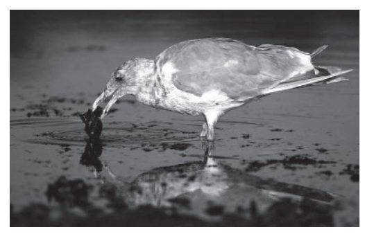
Figure 10. The Glaucous-winged Gull is present year-round in Theodosia Inlet but is most abundant when salmon are spawning. Esquimalt Lagoon, BC. 24 August 2005.