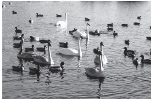
Figure 4. Trumpeter Swans seen flying over the study area on Theodosia Inlet likely originate from small numbers that regularly winter on nearby Cranberry Lake, BC. 22 January 2001.

Occurrence: Four adults seen flying northwest on 9 March 2004 and five adults flying southeast on 10 November 2004. Small numbers frequently winter on nearby Cranberry Lake (Figure 4).