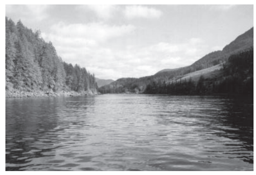
Figure 2. The study area is a relatively isolated site in Theodosia Inlet, BC and can only be reached through a narrow passage. 28 September 2007.

In the early 1900s, the Theodosia River supported magnificent salmon returns that were estimated at 100,000 Pink Salmon ( Oncorhynchus gorbuscha ), 50,000 Chum Salmon ( O. keta ), and 10,000 Coho Salmon ( O. kisutch ). In 1956 a dam was constructed on the river which diverted 80% of its flow into Powell Lake in order to generate hydroelectric power for the Powell River Pulp Mill. Today, First Nations, government, industry, and environmental groups are working towards restoring the river. In the meantime, a much smaller run of Steelhead Trout ( O. mykiss ) occurs from January to May, Cuthroat Trout ( O. clarki ) from January to July, and Coho Salmon in