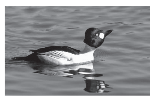
Figure 5. Small flocks of Common Goldeneye spend the winter in the Theodosia Inlet study area feeding and resting and in January courting activities are at a peak. Victoria, BC. 1 April 1997 (R. Wayne Campbell).