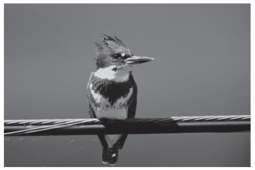
Figure 12. The Belted Kingfisher hunts prey from wires and pilings associated with log-booms in Theodosia Inlet, BC. Victoria, BC. 26 July 2005 (R. Wayne Campbell).

the largest numbers. Ten species actually feed on insects and marine invertebrates on log-booms and another two species (Great Blue Heron and Belted Kingfisher; Figure 12) use logs and pilings as perches to hunt from. Five other species forage low over log-booms to feed on flying insects (Table 2).