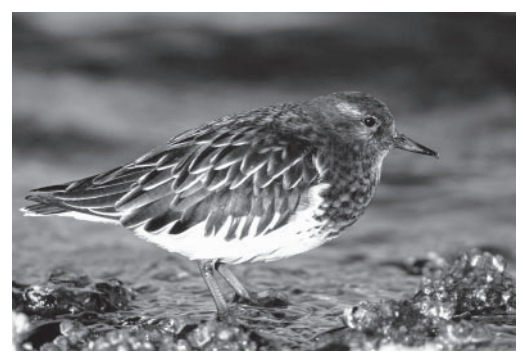
Figure 8. The Black Turnstone is one of the few species of shorebirds that regularly utilizes logbooms along the British Columbia coast for roosting and feeding. Victoria, BC. 31 October 2003.