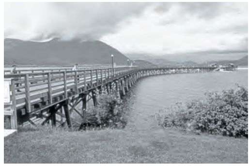
Figure 1 . Municipal wharf at Salmon Arm, BC., that supports a small colony of nesting Barn Swallows. 30 May 2009.

The Barn Swallow was likely from the small colony that breeds under the municipal wharf. I was unable to determine the age of the bird but newly fledged young from the first nesting would have