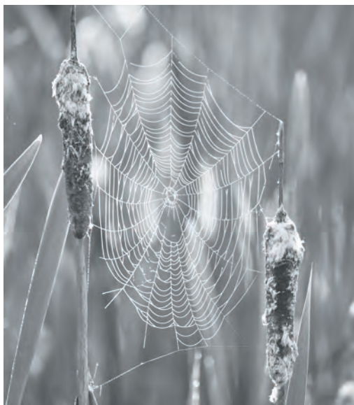
Figure 1. A spider web very typical of what I found during the first hour of my walk in the wetland near Valemount, BC.