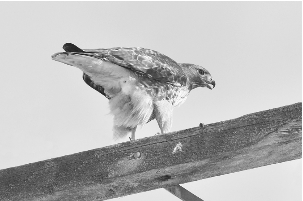
Figure 1. Red-tailed Hawk is a common resident and breeder throughout the Creston valley, BC.

by Red-tailed Hawks in nine of those years. Canada Goose ( Branta canadensis ) and Great Horned Owl ( Bubo virginianus ) also nested in the hawk territory. The territory was abandoned by Red-tailed Hawks in 2009, probably from concurrent nesting by Canada Goose.