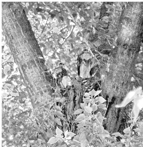
Figure 8. A pair of Red-tailed Hawks successfully fledged two young in one of the two active nests in 2006.

On 21 March, a Great Horned Owl was observed via a spotting scope sitting in nest “C”. It was apparent that young were present on 18 April as the adult was sitting high and off centre in the nest. Its mate was roosting in a cottonwood tree on the opposite