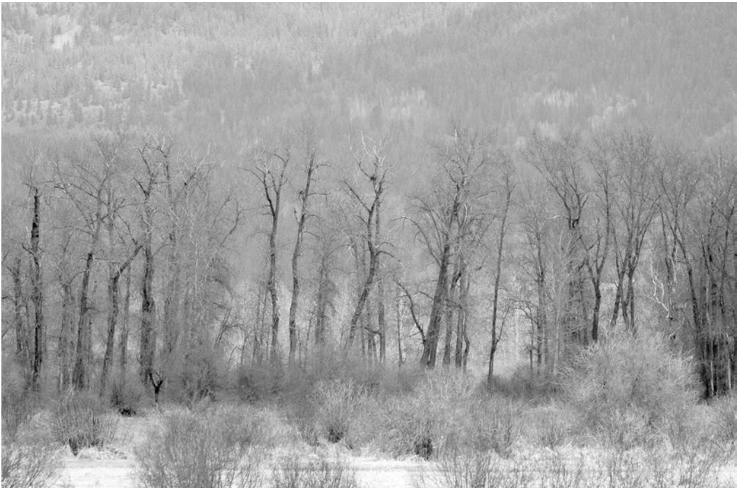
Figure 2. Riparian black cottonwoods adjoining wetlands and agricultural lands provide critical habitat for many nesting species of birds and mammals in the Creston valley, BC.

The nesting habitat (Figure 2) is composed of mature riparian black cottonwoods ( Populus balsamifera ) with an understory of red-osier dogwood ( Cornus stolonifera ) and black hawthorn ( Crataegus douglasii ). The breeding territory occupies a strip approximately 600 m by 50 m (1,968 ft x 165 ft) bordering the Kootenay River on the east and adjoins a farm field and dyke on the west. Three nests were built by Red-tailed Hawks in this territory, all in mature black cottonwood trees. A single nest (“A”) was available from 1998 to 2004. In 2004, a second nest (“B”) was built 90 m (300 ft) south of nest “A”, and in 2005 a third nest (“C”) was built 300 m (984 ft) southeast of nest “B.” The distance between nest “A” and nest “C” was 387 m (1,269 ft).