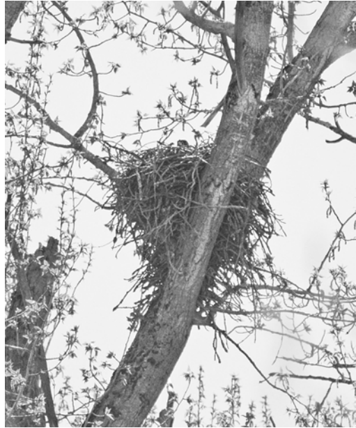
Figure 5. Red-tailed Hawk nests can be difficult to monitor early in the season as the adult is barely visible when incubating.

the mate was perched nearby. On 26 May, an adult was perched near the nest but there was no sign of young. I was unable to make further visits until early July and found the territory vacant.