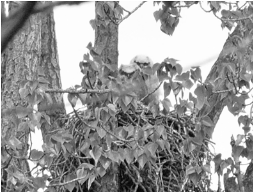
Figure 4. In 2001, a pair of Great Horned Owls claimed the Red-tailed Hawk nest and reared two chicks.

Red-tailed Hawks were again absent from this territory during the entire breeding season. However, it was exciting on 26 April to find a Great Horned Owl ( Bubo virginianus ) occupying nest “A”. The adult was sitting high in the nest brooding one downy chick, visible as it moved about under the adult’s breast. It was a warm day at 18.9° C and the adult was observed “gular-fluttering”. On 6 May, two downy chicks were standing in the nest (Figure 4) with the adult roosting nearby. My last visit on 11 May, found the adult standing in the nest with one chick nearby and the second crouching in the nest. Wing and tail feathers were developing on the chicks.