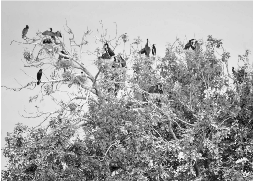
Figure 11. In British Columbia, Double-crested Cormorants typically build their nests on the ground on small islands. In the Creston valley, however, the threatened species builds its nests in branches of riparian black cottonwood trees, further emphasizing the importance of protecting extant stands of mature cottonwoods.

I would like to thank Wayne Campbell for kindly reviewing the manuscript and for suggesting helpful references.