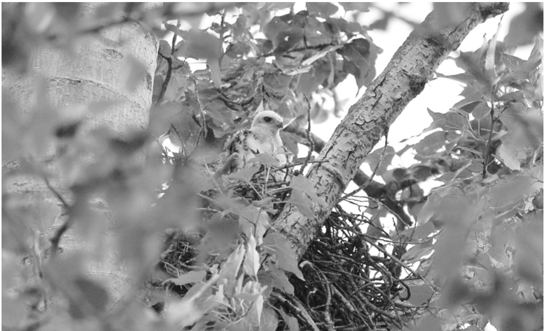
Figure 3. One of two Red-tailed Hawk chicks in 1999 indicates nesting is well-advanced.

Adult Red-tailed Hawks were absent from this territory when an initial visit was made on 16 March and remained absent for the entire breeding season. On 1 April, an adult Canada Goose ( Branta