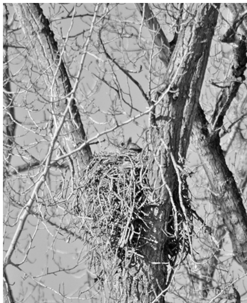
Figure 9. In 2006, the second Red-tailed Hawk nest was occupied by a Great Horned Owl whose young did not survive.