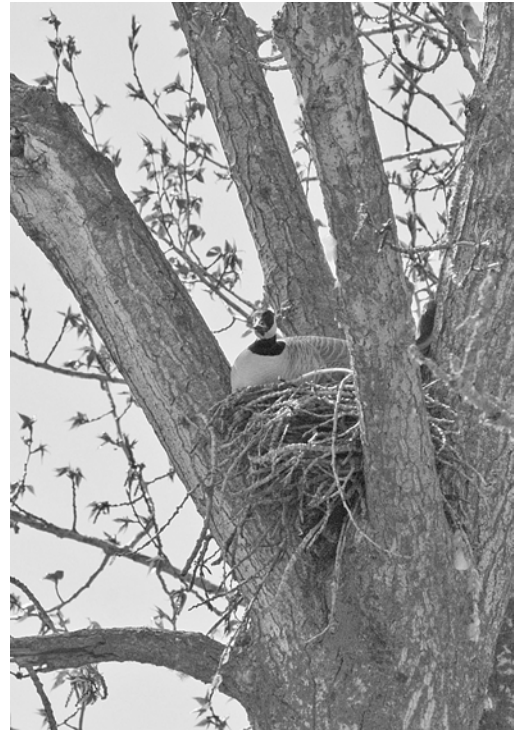
Figure 10. Canada Goose commonly uses nests of Red-tailed Hawk and Osprey in the Creston valley, BC.

On 15 March, a Canada Goose (Figure 10) occupied nest “C” and on 19 April, a Canada Goose occupied nest “B”.