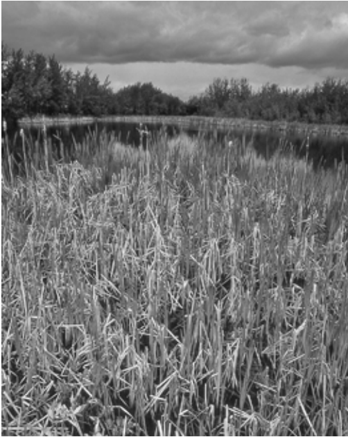
Figure 5. Sudeten marsh is a small productive wetland nestled in a stand of mixed trembling aspen and willows in farmland, where 12 species of wetland-associated birds were found nesting between 1978 and 2008.