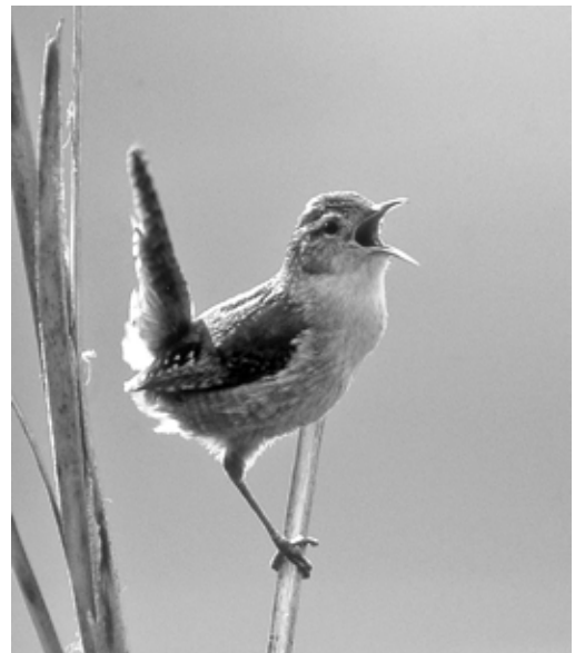
Figure 16. It cannot be assumed that Marsh Wrens are nesting in a wetland by only observing or hearing the species. I heard birds singing but did not find any nests.

One or two Marsh Wrens (Figure 16) were heard singing in cattails on four of the six visits (Table 3) but no new or old nests were found although the habitat appeared suitable for nesting. The dates of visits, from 28 May to 27 June, are within the breeding period for Marsh Wren in British Columbia (Campbell et al. 1997; p. 330, Phinney 1998, p. 42). Phinney (1998) gives an arrival date of May 17, 1992 for the Dawson Creek area.