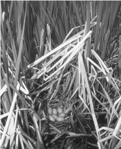
Figure 11. Breeding information collected for 13 Ring-necked Duck nests found at Sudeten marsh between 1978 and 2008 is new for British Columbia (Campbell et al. 1990a). The pile of wet cattails in this nest suggests egg-laying is complete and incubation is to begin soon when new, dead, dry cattail leaves will be added. A water test confirmed that incubation was fresh. Photo by R. Wayne Campbell, 14 June 2004.

Calculated dates for the annual nesting chronology in Table 3 were created from details in Mendall (1958) and Hohman and Eberhardt (1998). If young remain on Sudeten marsh until first flight the entire breeding period could extend from mid-May to August 11, a total of at least 89 days. The nesting chronology falls within the dates reported by Campbell et al. (1990a) for British Columbia. Phinney (1998) gives an arrival date of 13 April 1992 for the Dawson Creek area.