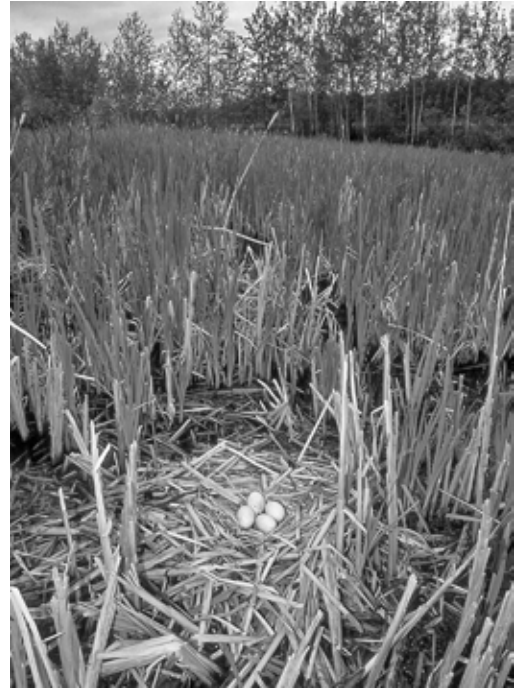
Figure 10. This Canada Goose nest, found on 14 June 2004 at Sudeten Marsh, contained four fresh eggs. Although the adult was flushed, no adults were seen during the from shore observations on the initial visit. By floating the eggs in water the stage of incubation can be determined that allows a breeding chronology to be calculated.

Phinney (1998) gives egg dates for two complete clutches as 29 and 30 April suggesting that Canada Goose may begin nesting as early as mid-April.