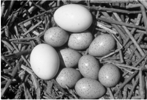
Figure 9. Although Ruddy Ducks commonly lay eggs in the nests of American Coots (shown) and Ring-necked Ducks, no egg-dumping was found at Sudeten marsh. Photo by R. Wayne Campbell, Douglas Lake, BC, 14 June 2011.

Some of the value-added information for 12 species of birds breeding at Sudeten marsh includes the following details.