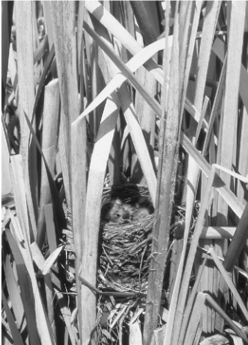
Figure 17. Red-winged Blackbird territories were established in large and small patches of dead cattails surrounding Sudeten marsh and over the six visits between 1978 and 2008 the nesting population more than doubled.

All nests ( n = 176 ; Figure 17) were attached to the stalks of dead cattails in 0.3 m to 1.1 m of water. Nest heights above water, measured from water to bottom of nest, ranged from 20.3 cm to 91 cm (mean 38.6 cm). All nests were compact structures composed of strips of interwoven dead cattail leaves and lined with fine, dry grasses. Outside diameters ranged from 9.5 cm to 14.5 cm (mean 12.0 cm) and nest height from 8.5 cm to 18.5 cm (mean 12.5 cm). These measurements are within those reported by Beer and Tibbits (1950) for Wisconsin, Holcomb and Tweist (1968) for Ohio and Michigan, and Peck and James (1987) for Ontario.