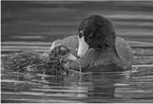
Figure 7. A pre-count of marsh birds heard and seen on Sudeten marsh on 14 June 2004 suggested that five wetland-dependent species may be nesting, including an adult American Coot feeding a chick. Later, a complete search determined that 10 species were actually nesting and 41 nests were tallied.

The pre-survey count was made from a single vantage point at the south end of the marsh near the top of a slope. This was followed by a thorough “in-marsh” nest search of emergent vegetation and open water. Sudeten marsh was surveyed with chest waders (Figure 8) and each visit lasted between 2½ and 3½ hours, depending if a scribe was available to record information from shore. More extensive beds of cattails were surveyed in a 2-m linear strip to assure completeness. Nest materials were noted and each nest was measured and a sample of the stage of incubation for eggs was determined using the water test (see Campbell and Preston 2001, p. 21). Nestlings, grebe chicks, and ducklings were also aged (see Campbell et al. 2013, p. 94 and 96). Other information recorded included predation (see Campbell 2011), parasitism, egg-dumping, mortality, the occurrence of runt eggs, and general condition of the wetland.