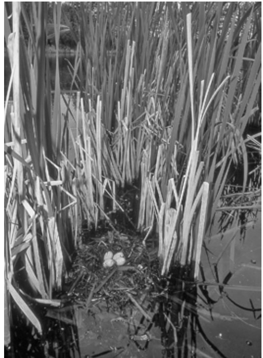
Figure 13. The 15-minute pre-count survey allows nesting Horned Grebes on Sudeten marsh to cover their nest and eggs with wet marsh vegetation so the clutch is not visible (left). Value-added information from “in-marsh” surveys, such as nest descriptions and measurements and clutch size, often contributes to the life history of the species and is helpful in conservation activities.