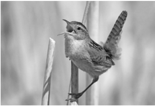
Figure 1. This North American songster is a good indicator of the general health of cattail and bulrush marshes because of its invertebrate diet. A male Marsh Wren mates with more than one female in a breeding season and may build up to 27 nonbreeding “dummy” nests (usually 5-6) that are not used by the female to lay eggs. In a marsh with six territorial males at least 30 nests could be checked before eggs are found.

Although results vary between wetlands and years, one of the purposes of this article is to chronicle the two methods: inventorying and monitoring species from initial land-based observations (Figure 3) that include songs and calls followed by direct “in-marsh” nest searches for species. I did not use recorded playback of songs or calls. The results are dramatic and revealing. I estimate that I surveyed and monitored about 680 fresh-water wetlands, marshes, and swamps in this manner during nearly 1,500 visits since the early 1970s. The major emphasis has been on wetlands on the southern coast and the interior of the province.