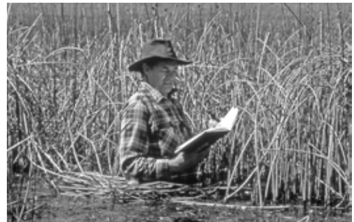
Figure 8. Early nest searches of marshes with emergent cattails and bulrushes were completed without chest waders. Photo by Andrew C. Stewart, Stump Lake, BC, 28 May 1995.

1 Scientific names of birds mentioned in the text and Tables 1, 2, and 3 are listed in Appendix 1.