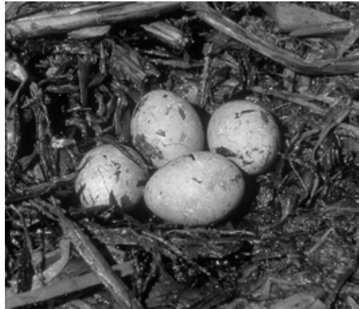
Figure 12. The stained eggs in this Pied-billed Grebe nest, caused when decaying vegetation is used to cover the clutch when feeding or during disturbances, suggest that incubation is advanced.

The nest was constructed on water anchored by dead cattails at the north end of the marsh in 56 cm of water. A Horned Grebe nest was 24 m away. The nest platform was constructed of decaying plant material and measured 20 cm in diameter and 4 cm high. It contained four eggs, one of which was pipping. The nest was uncovered and the eggs were warm (Figure 12). Phinney (1998) mentions a pair with “four small chicks” on 14 June 1993.