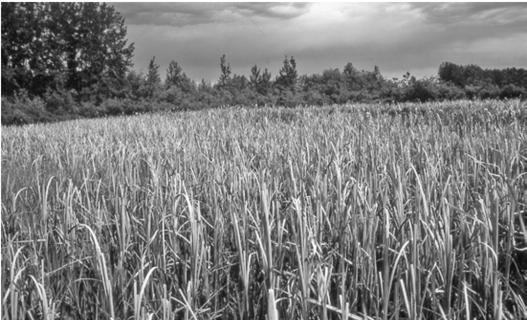
Figure 2. Since the late 1960s about 680 fresh-water wetlands have been completely surveyed and monitored for marsh-nesting birds in British Columbia, including six nest searches between 1978 and 2008 in this dense growth of cattails at Sudeten marsh. Photo by R. Wayne Campbell, 22 June 2008.

Complete surveys of many large and small wetlands in British Columbia are achievable, and although time-consuming, may produce information that better depicts the true nesting diversity and composition of breeding birds, and contributes greatly to the regional life history cycle for wetland-nesting species. The objectives of wetland research should be to: