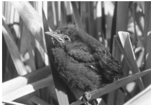
Figure 20. Nestling Common Grackles depart their nest between 12 and 15 days and although not fully capable of flight clamber among the cattails waiting to be fed by adults.

Calculated dates for the annual nesting chronology in Table 3 were generated from details in Peterson and Young (1950), Jones (1969), Maxwell (1970), Maxwell and Putnam (1972), Howe (1976), and Peer and Bollinger (1997). If young leave the nest on Sudeten marsh just before first flight the entire breeding period could extend from about 4 May to 8 July, a total of at least 66 days (Table 3), which is about one week earlier than reported by Campbell et al. (2001, p. 449) for the Boreal Plains ecoprovince. Peck and James (1987) give the earliest egg date for southern Ontario as 4 April. Phinney (1998) gives an early arrival date of 21 April 1993 for the Dawson Creek area.