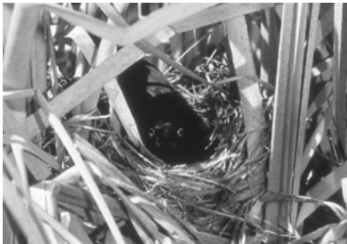
Figure 19. Adult female Common Grackle incubating in well-concealed nest attached to the stalks of dead cattails. Sudeten marsh, BC, 4 June 2008.

All nests ( n = 31 ) were in dense cattails along the east side of the Sudeten marsh attached to stalks of dead cattails (Figure 19) in 0.7 m to 1.0 m of water. Nest heights above water, measured from water to bottom of nest, ranged from 25.4 cm to 91 cm (mean 45.7 cm). All nests were rather compact structures composed of dead cattail leaves (some shredded) and