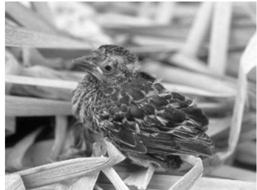
Figure 18. When nestling Red-winged Blackbirds first leave the nest they are incapable of extended flight and depend on their parents to feed them on territory for another 14 days.

Calculated dates for the annual nesting chronology in Table 3 were created from details in Nero (1956, 1984), Holcomb and Tweist (1968), Orians and Beletsky (1989), Martin (1995), and Yasukawa and Searcy (1995). If young remain in the nest on Sudeten marsh until first flight the entire breeding period could extend from about 20 May to 20 July, a total of at least 62 days (Table 3; Figure 18), which is about two weeks longer than reported by Campbell et al. (2001, p. 399) for the Boreal Plains ecoprovince. The later date corresponds with the 4 July date for eggs found by Phinney (1998). Peck and James (1987) give egg dates for Ontario from 25 April to 3 August ( n=641 nests) with half of those between 26 May and 13 June. Phinney (1998) gives an early arrival date of April 17, 1991 for females in the Dawson Creek area and states that “females arrive at least two weeks after the first males.”