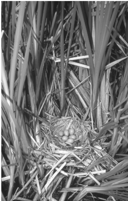
Figure 15. The full breeding cycle for American Coot on Sudeten marsh, from nest-building to first flight, may extend nearly four months, from mid-May to early September.

From one to four pairs of American Coots nested in five of the six years. All but one nest was located in cattails along the east side of the marsh in 0.8 m of water. The other nest was quite exposed in a narrow band of cattails on the west side in 46 cm of water. Interior nests, up to four metres inside the cattails, had a clear path to open water. All nests ( n = 9 ) were floating baskets of interwoven dead cattail leaves from 33 cm to 41 cm (mean 36 cm) in outside diameter (Figure 15) anchored to cattail stems. Nest heights above water ranged from 15 cm to 25 cm (mean 22 cm). No nests had ramps and no nonbreeding nest platforms were found (see Gullion 1954).