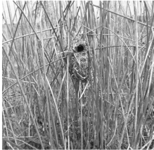
Figure 6. Besides determining species composition and nesting population, “in-marsh” surveys provide value-added information that may include nest composition and dimensions, nest substrate, stage of incubation and nestling development, and mortality and predation. With Marsh Wrens, for example, the number of “dummy” nests per territory can be ascertained.

These surveys do not count all individuals occurring or nesting in a particular wetland and remain as estimates of abundance or density that require further statistical analysis to determine variations in detection probability (see Legare et al. 1999). The survey approach also provides little “value-added” information that can be critical in management and conservation activities (Figure 6).