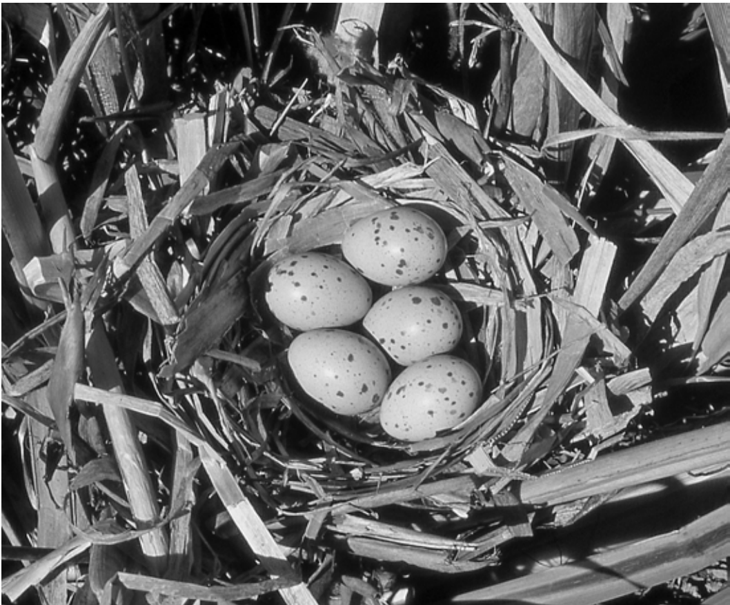
Figure 14. Soras begin egg-laying as soon as nest-building begins and add eggs until the final basket of loosely woven dry cattail leaves is attained.