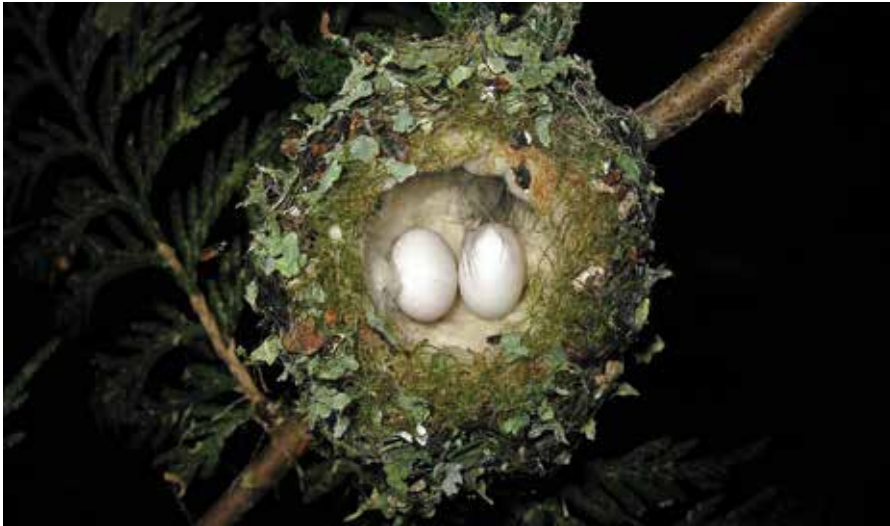
Figure 6. In late March, soon after the first migrant Rufous Hummingbirds appear on southern Vancouver, Mark is checking old nest sites and finding new ones.