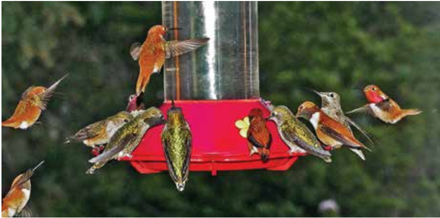
Figure 5. Male Rufous Hummingbird and female Anna's Hummingbird (right) sharing a feeding port at the same time.

In Cadboro Bay, the first Rufous may not be seen for up to a week later but Mark is already out looking for the first Rufous nests. His earliest nest, with 2 young 10 days old, was found on April 10. Back calculating suggests nest-building would have begun around March 13 and incubation on March 17. (Figure 6). By the end of a single season, Mark will have found