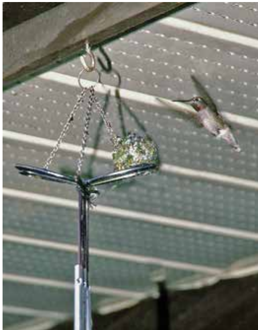
Figure 10. Nest sites for Anna's Hummingbird in North America are notably all on plants, mostly a variety of trees. The nest built on the wings of a dragon fly wind chime under the eaves of a house near Victoria was the first nest site reported on a human structure. 10 (Photo by Lance Bull, Royal Oak, BC, January 19, 2008. BC Photo 3631c.

Autumn – The tail end of breeding may extend into this season but it is mostly a time for reflection, rest, and keeping feeders full. But, there can still be surprises. At the time The Birds of BC was published 17 the breeding period for Anna's extended from 15 February through 10 August or 177 days. Gradually the breeding period was being extended and on September 2 [2009] Wayne watched a large nestling fluttering its wings on the edge of a nest. The following day the young bird was seen at the feeder being pumped with sugar-water and the female fed the young bird until September 14, 12 days after leaving its nest. The new breeding period for Anna's