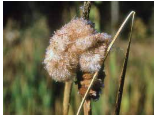
Figure 4. Anna’s Hummingbirds readily use the flower spikes of cattails (shown) and pampas grass as nesting material if set out in winter near feeders.

Spring – The focus turns to spotting the first returning Rufous Hummingbird from its wintering grounds in southern Texas and Mexico. In early spring and summer, when both species are present in large numbers, hummers provide a constant spectacle of activity. The male arrives first and Ron starts looking in early March. He has seen one as early as March 12 but March 19 is the average arrival date at Coles Bay. Females arrive from 1-6 days later (Table 2). In Cadboro Bay, single males are seen 4-7 days later, the earliest date being March 19 (Table 4). The earliest returning date for southern Vancouver Island is March 6.