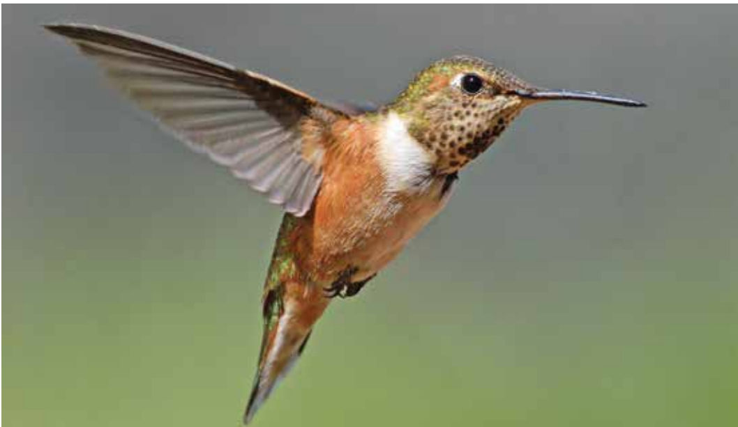
Figure 1. The Northern range expansion of Anna's Hummingbird (next page) from California in the 1950s was viewed by some hummingbird lovers on southern Vancouver Island as a threat to the common Rufous Hummingbird (above). In 2004, data were gathered to assess the concern.

the past decade or so. But when their experiences and notes were brought together, a unique collection of information on the life of Anna's and Rufous hummingbirds emerged, especially for southern Vancouver Island (Figure 1).