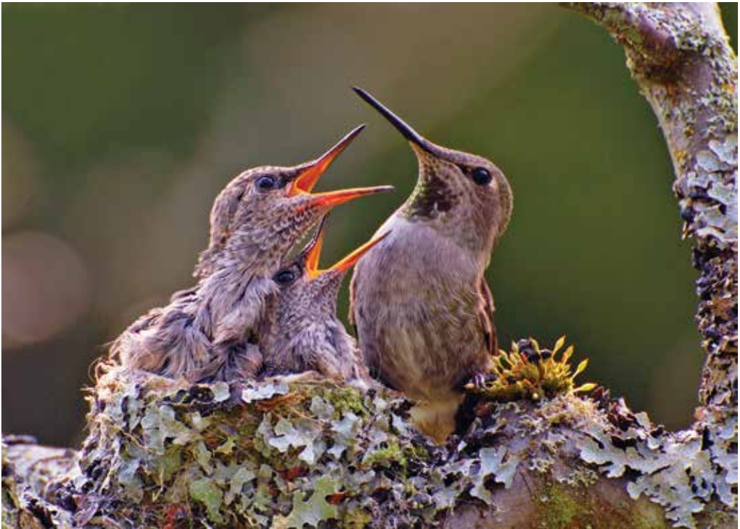
Figure 7. Fledglings are dependent on parents for 1-2 weeks after developing for at least 23 days in the nest. By mid-April, three separate families may have already visited feeders.