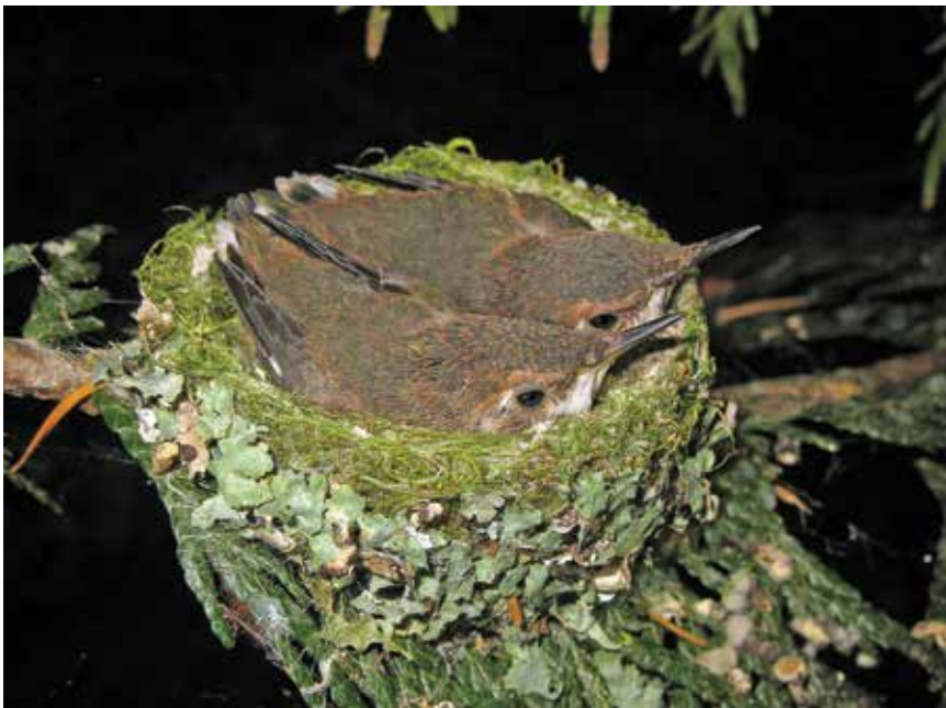
Figure 9. By late July most young have fledged from active Rufous Hummingbird nests on southern Vancouver Island.

Summer – Mark continues his hummingbird nest-finding and rechecking nests but spends more time searching for other species. By August, southern Vancouver Island is like a nesting doldrums but it is also a time of exodus. While new broods of the resident Anna's are still coming to feeders Rufous' are departing. Most males leave from mid-June to early July and move to higher elevations where flowering plants are blossoming. Females leave soon after their young fledge (Figure 9); most have departed by early August.