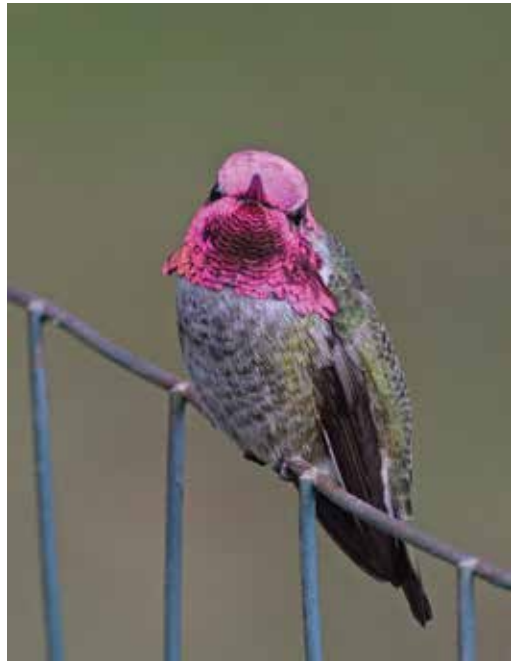
Male Anna's Hummingbird