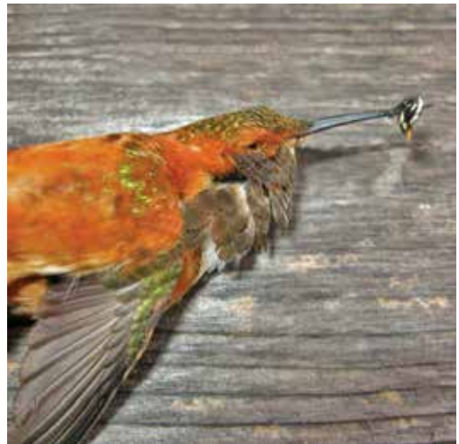
Figure 11. Male Rufous Hummingbird with a Bald-faced Hornet on the tip of its bill which could not be opened to feed.