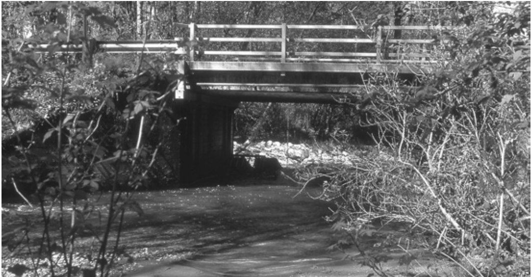
Figure 2. The Salmon River runs through the municipalities of Langley and Aldergrove in the Fraser River valley, BC, and most American Dipper nests found along this watercourse were on support structures under bridges. Salmon River (Langley), BC, 27 April 1996.