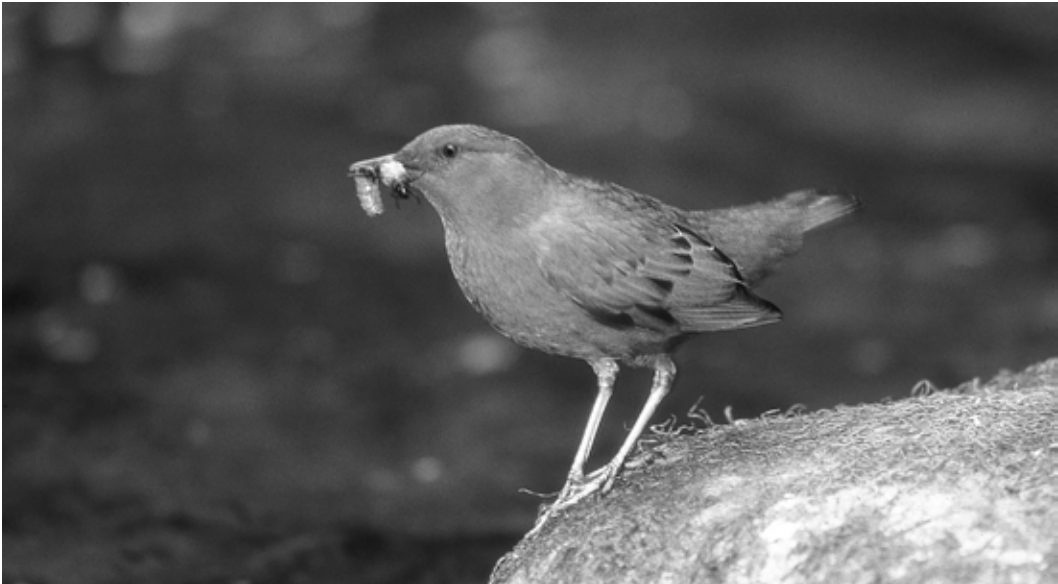
Figure 1. American Dipper is often considered a useful biomonitor of the health of mountain watercourses because of its preference for clear, unpolluted streams where it feeds and nests.

Nests are built near swift water and are usually inaccessible to terrestrial mammalian predators, protected from flood waters, and sheltered from inclement weather (Loegering and Anthony 2006).