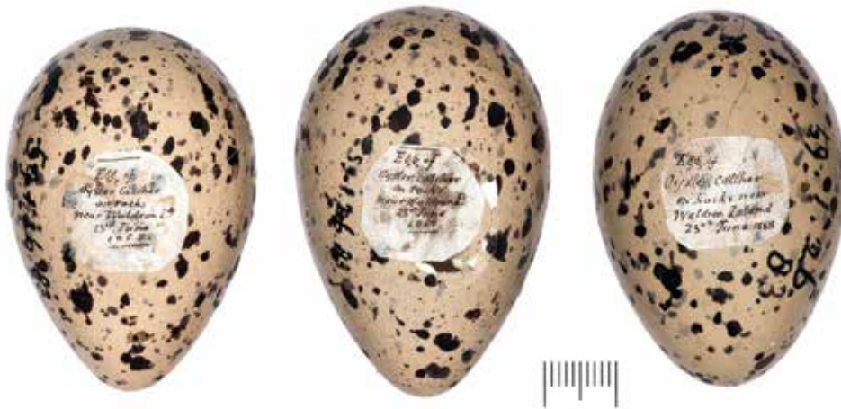
Figure 2. Black Oystercatcher eggs (NHMUK E/1859.1.26.83 [part]) catalogued as collected at “Waldron Island, Vancouver Island” on 23 June 1858. Waldron Island was claimed by the U.K. as part of the British colony of Vancouver Island in 1858 (see text) and this record can be considered the earliest known breeding record for British Columbia and Canada. The island was ceded to the U.S. in 1872.