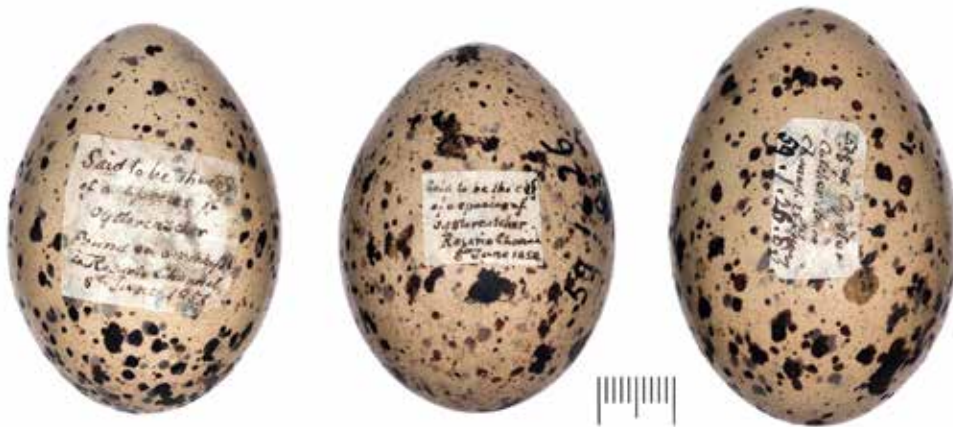
Figure 3. Black Oystercatcher eggs (NHMUK E/1859.1.26.83 [part]) catalogued as collected at “Rosario Channel, Vancouver Island” on 8 June 1858 (two eggs on left) and “Haro Channel” on 25 June 1858 (right). The eggs from Rosario Channel represent the third breeding record for Washington, while the egg from “Haro Channel” (likely Mandarte Island) represents the second breeding record for British Columbia.