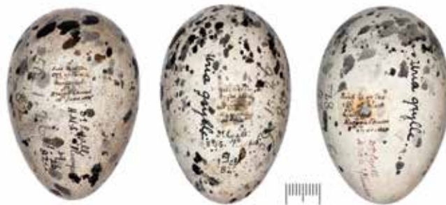
Figure 5. Pigeon Guillemot eggs (NHMUK E/1859.1.26.82 [part]) catalogued as collected at “Rosario Channel, Vancouver Islands.” The egg on the right was collected on 8 June 1858 and the two on the left on 10 June 1858; these eggs represent the fifth breeding record for Washington.