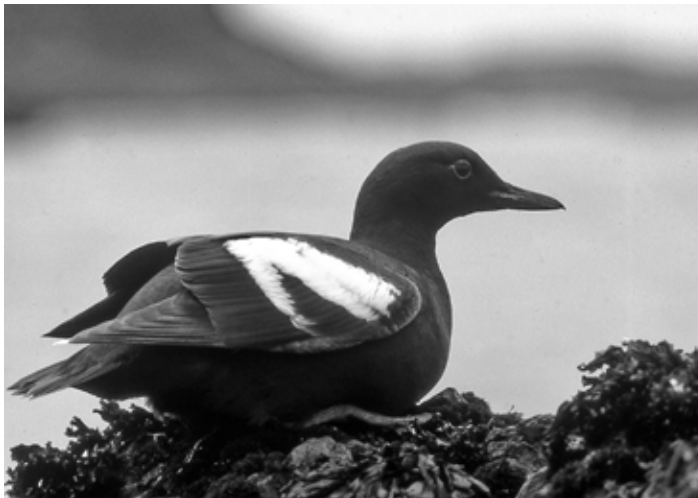
Pigeon Guillemot.

Upon reconsideration of this breeding record, it has come to light that two eggs (marked \alpha , \beta in Figure 4b) were apparently stolen and replaced with similarly pigmented and shaped eggs of similar size. The two suspect eggs may be incompletely catalogued and unregistered Black Guillemot eggs, possibly from the 19 th century collection of Graf von Rödern,