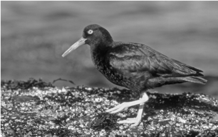
Black Oystercatcher.

In the Natural History collections of the National Museum of Ireland (NMI-NH), 2 Black Oystercatcher eggs (NMI-NH 2008.74.496), likely from the same clutch, were obtained at “Vancouver Island” by an unknown collector without a collection date (P. Viscardi, pers. comm.). No other egg specimens from Vancouver Island were found in the NMI collection, which could have facilitated the identification of the collector or date of collection. However, a group of at least 51 skins obtained by Charles B. Wood also are labeled from “Vancouver Island”, although no Black Oystercatcher skins were among them. Captain Richards had presented Wood’s collection of “...Birds, Birds’ Eggs, Shells, Fossils, &c...” to the Royal Dublin Society (later incorporated into the NMI-NH collection) sometime before February 1864 (Carte 1866:284) but Wood was lost at sea when a small boat carrying him and other officers of HMS Orlando capsized off Tunis in November 1864 (Randolph 1864). Only one of Wood’s skins (NMI-NH 2008.51.296) bears a collection year (1861), indicating that he usually did not carefully record the year and date of collection. Mayne (1862:418) reported notes about birds provided by Wood but only the presence of Black Oystercatchers was mentioned. Given that